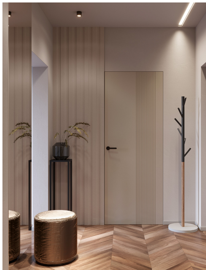
Flush-to-Wall Door Frame in Matte Lacquered Silk Grey