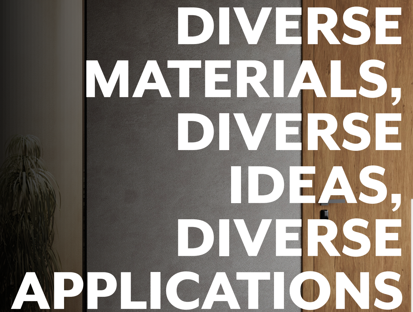
Hinged Door Frame in American Walnut Veneer