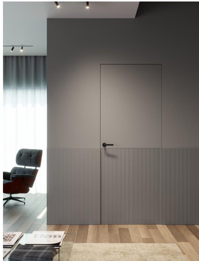
Flush-to-Wall Door Frame in Matte Lacquered Dusty Grey