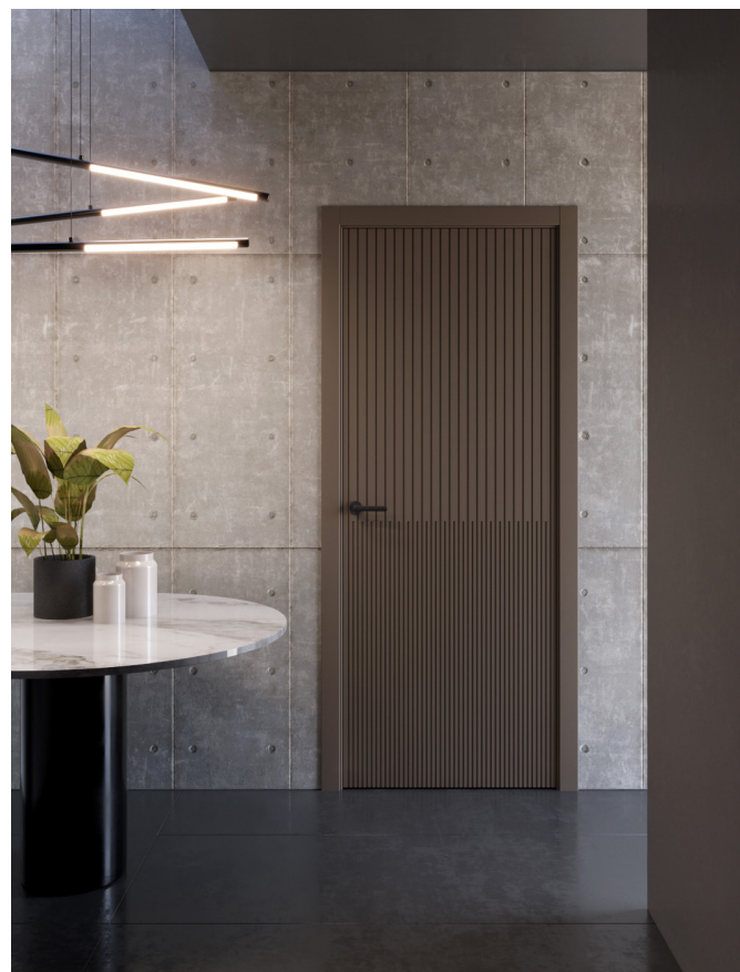
Hinged Door Frame in Matte Lacquered Oak Brown