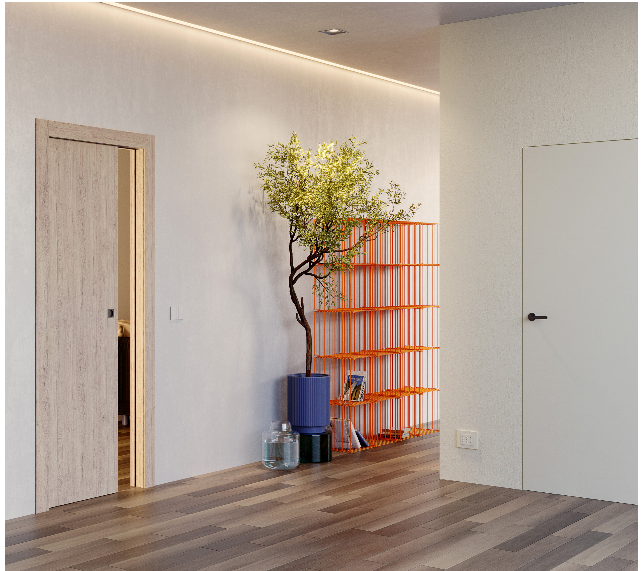
Sliding Door Frame with Veneer and Breeze Oak

Acoustic and thermal performance share the same insulating properties, resulting in a quieter, more temperature-stable interior. Greater door thickness amplifies both benefits, improving overall comfort and control.