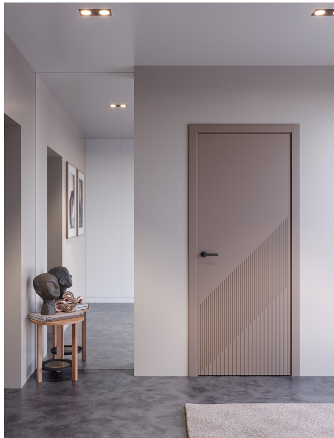
Hinged Door Frame in Matte Lacquered Putty Grey