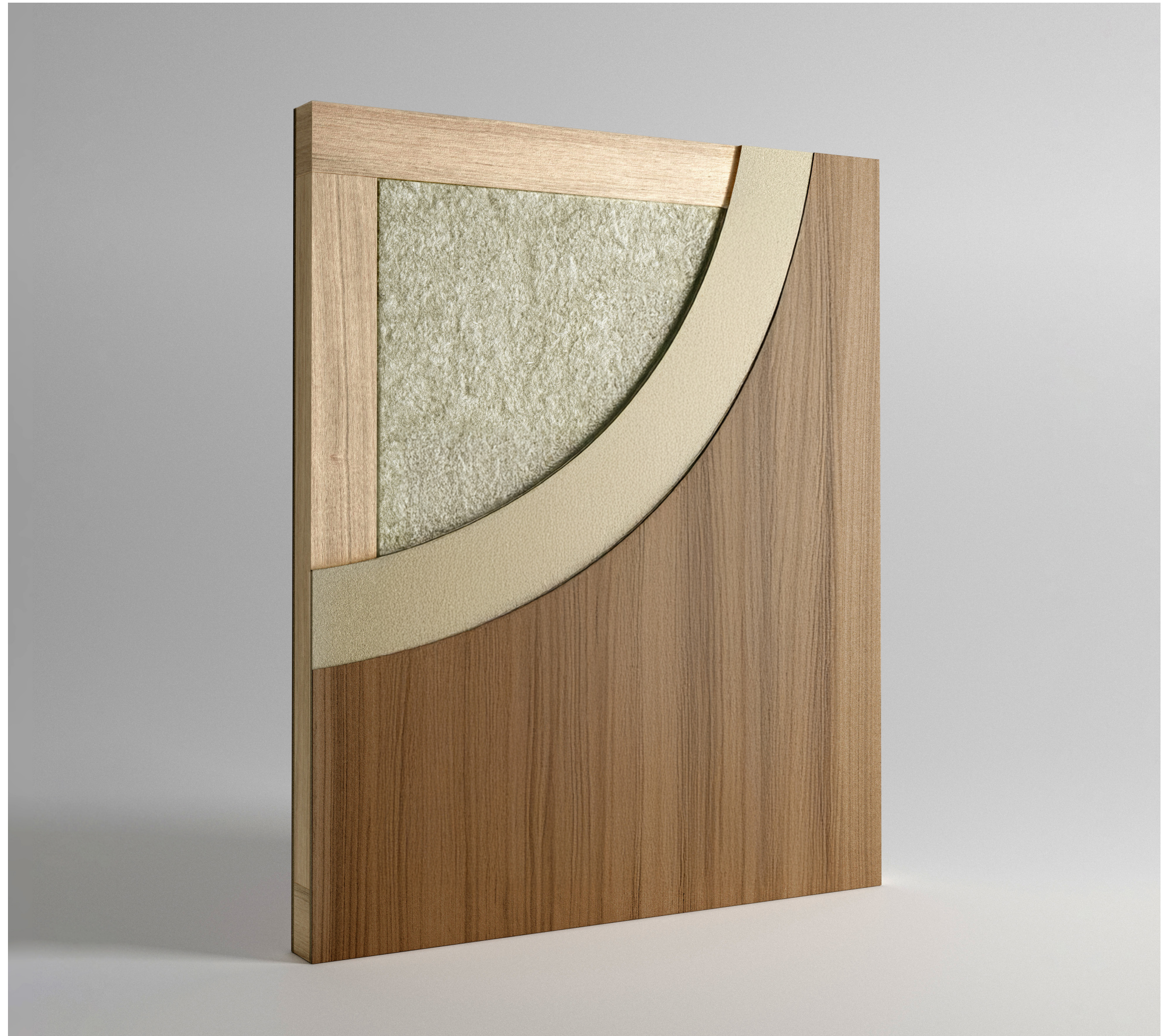
High-End Door Systems

LR Custom materials improve acoustic comfort by controlling reverberation, reducing outside noise, and balancing how sound moves through a space. The result is a healthier, calmer, and more comfortable living environment.